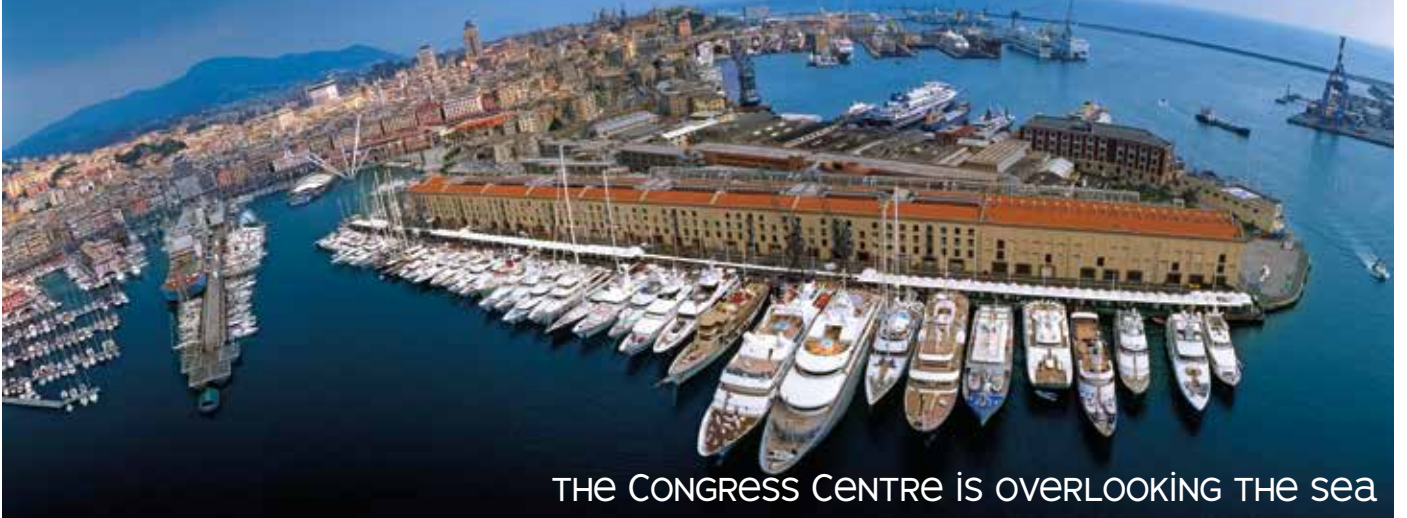
THE CONGRESS CENTRE IS OVERLOOKING THE SEA

the Largest Medieval centre in Europe UNESCO World heritage List